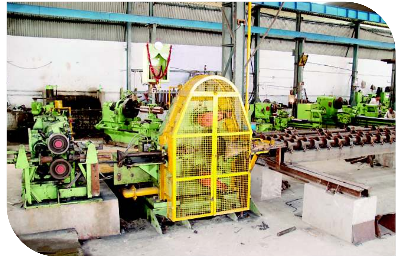
Tail Braking Pinch Roll